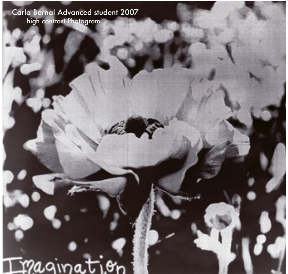
Carla Bernal Advanced student 2007 high contrast Photogram